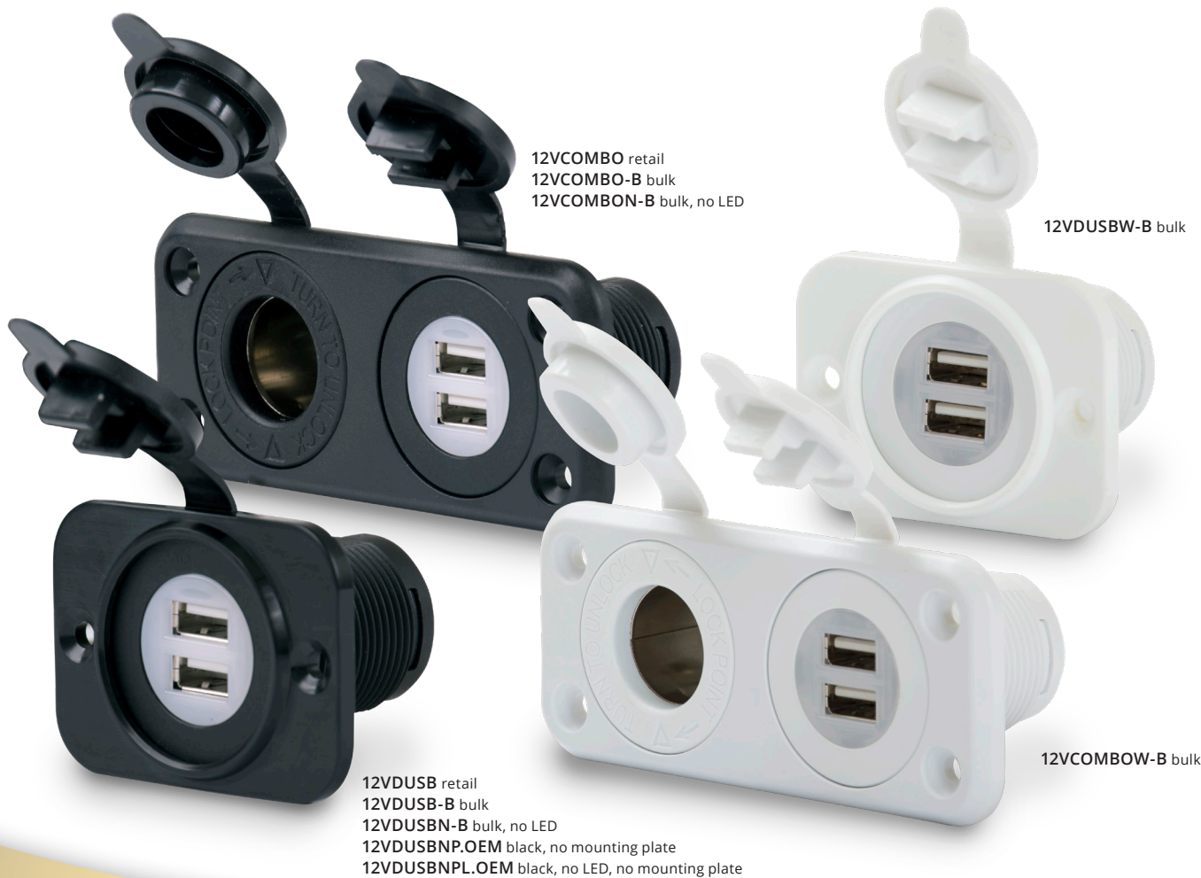
12VCOMBO retail 12VCOMBO-B bulk 12VCOMBON-B bulk, no LED